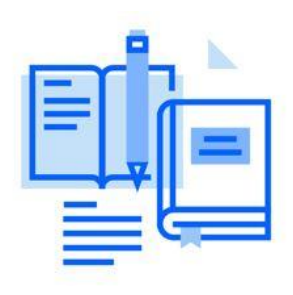
Readings. Questionnaires. Case studies